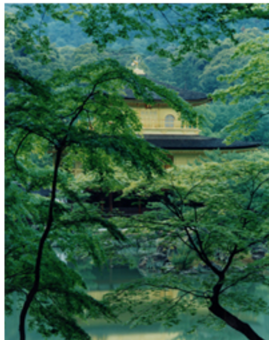
Rokuonji Temple